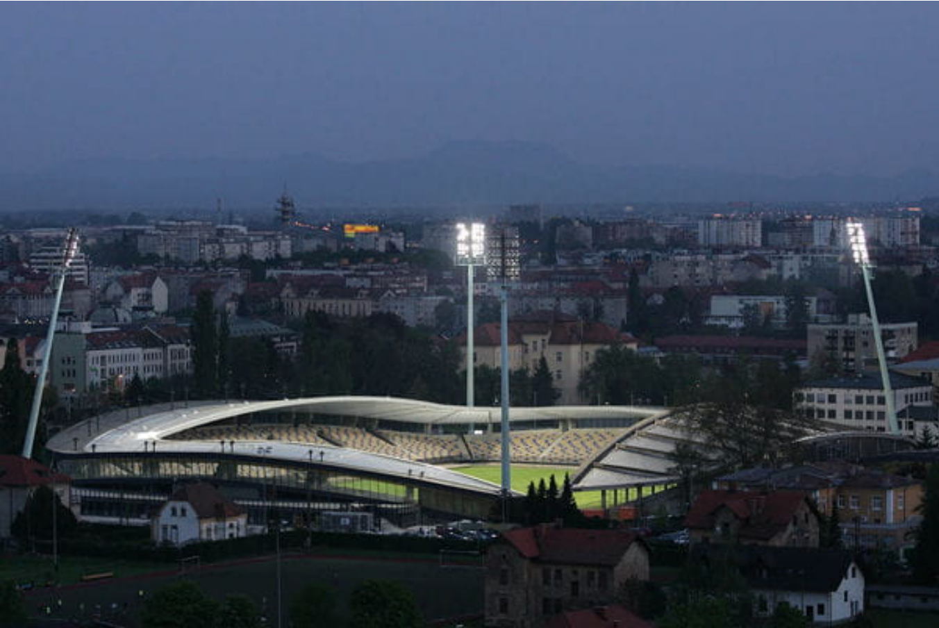
Turf conditioning at NK Maribor stadium in Slovenia