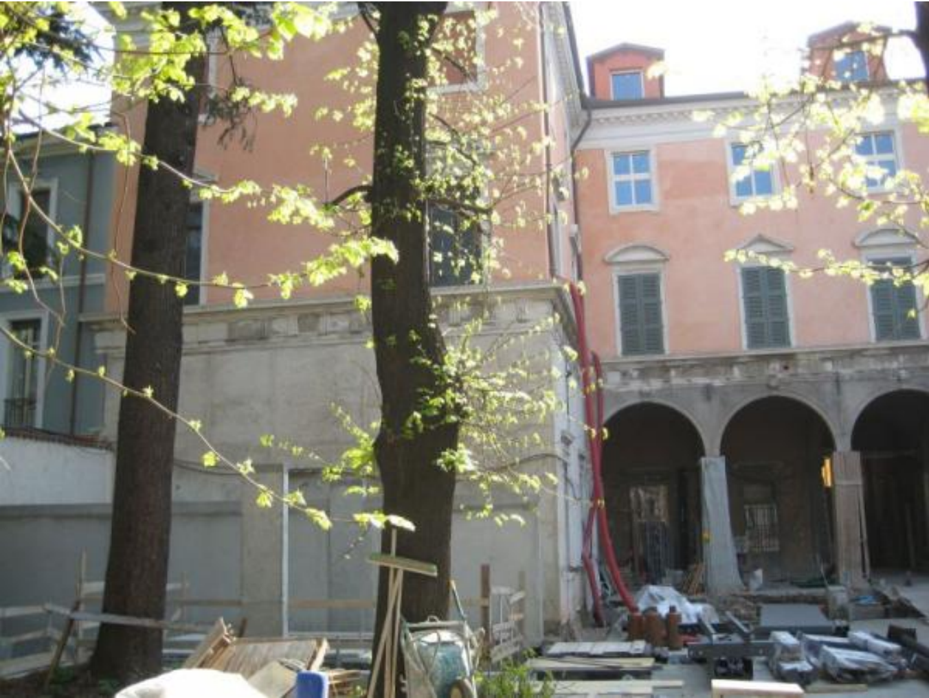
Palazzo Ferrazzi - Brescia