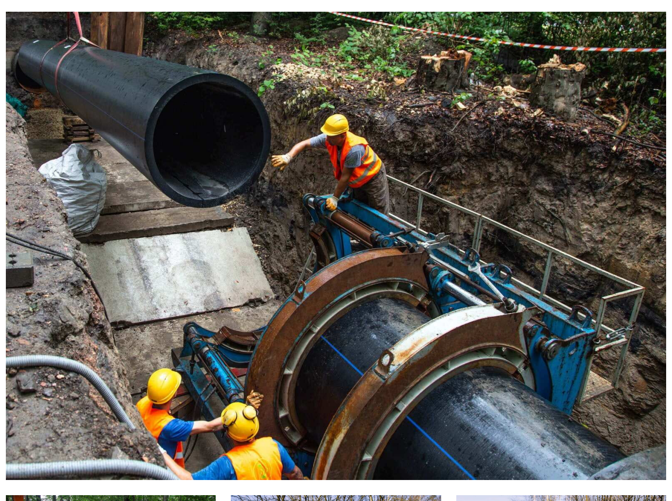
Renovation of a water supply system in an area with mining damage