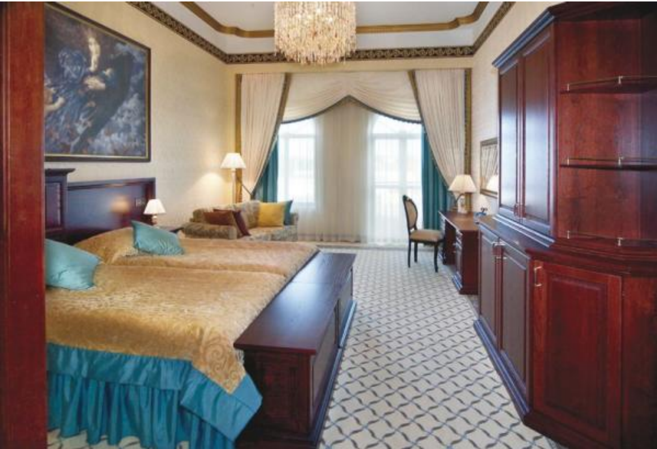
The extension of Veljekset Keskinen is heated with Uponor's underfloor heating system