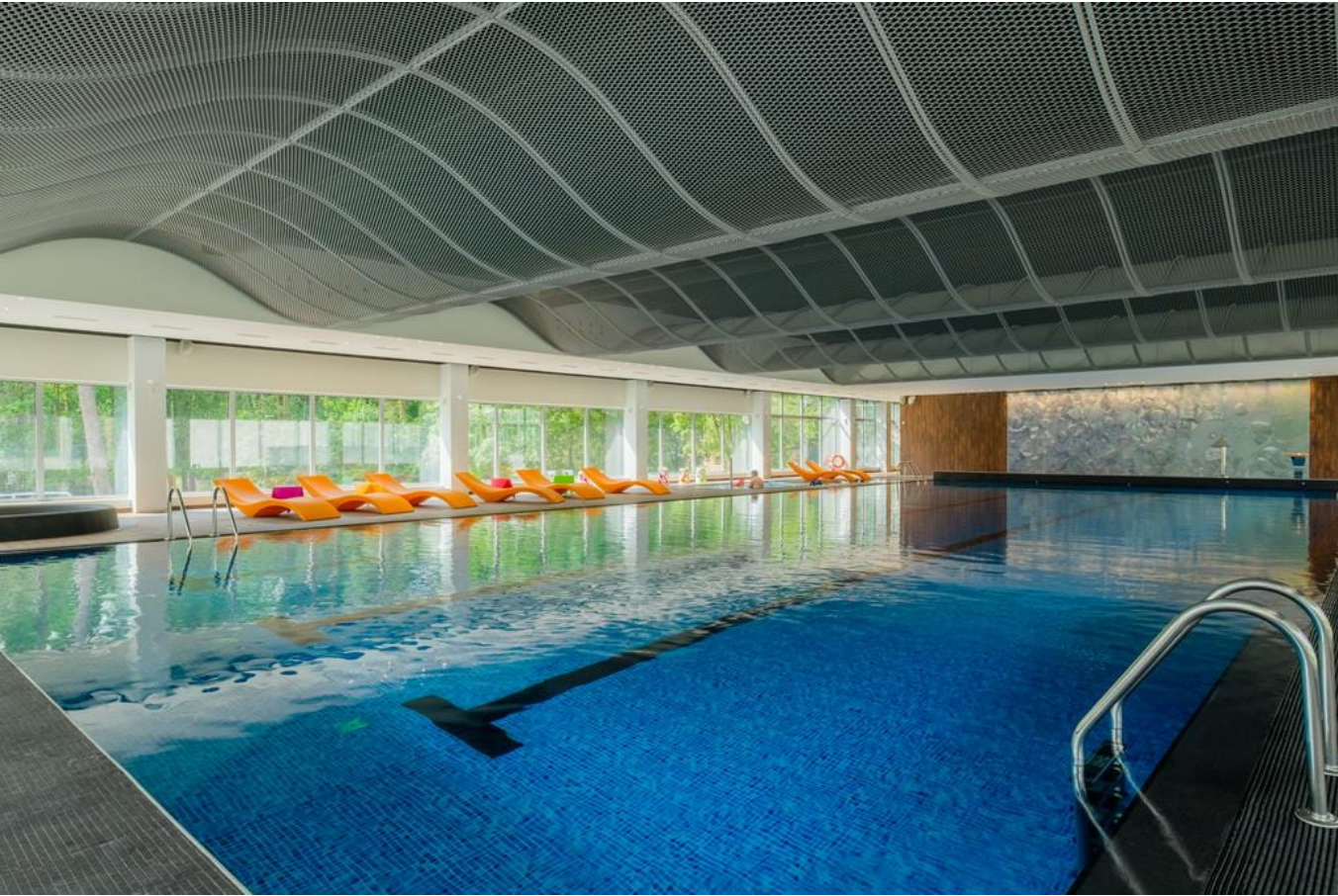
Lielupe Hotel by Semarah, Jurmala