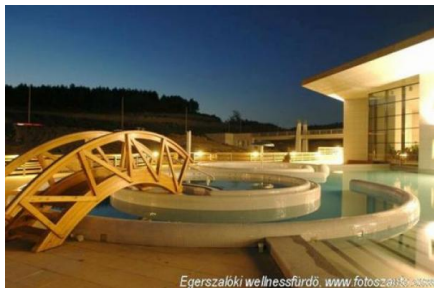
Egerszalóki wellnessfürdő