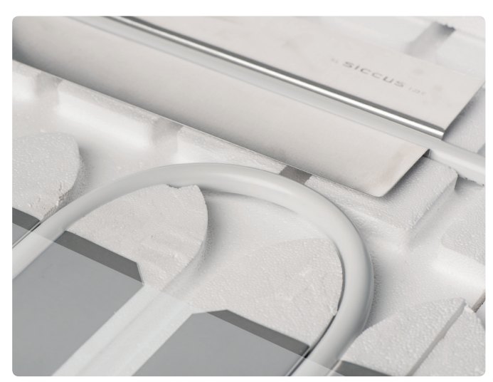
Just four components: mounting sheet, heat conducting plate, heating pipe and PE foil

The integral pipe guide channels in the Siccus mounting sheet hold the heat conducting plates and heating pipes. The mounting sheet is flexible to use, easy to cut and pre-fitted with channels in the "header area" for Uponor PE-Xa and MLC pipes.