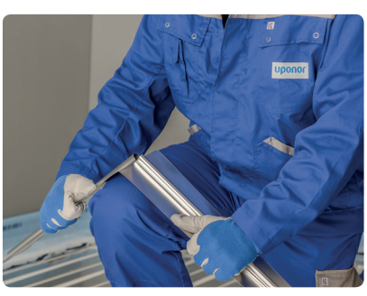
Divide the heat conduction plate by bending it only

MLCP white. They all provide the ideal combination of heating circuit size, installation height and flexibility.