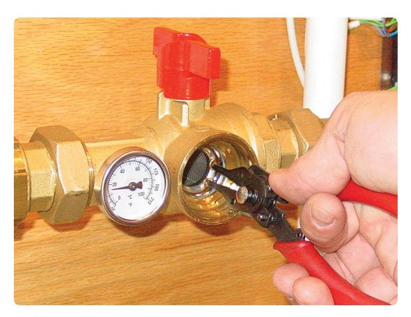
Step 3: Remove the circlip which retains the filter.