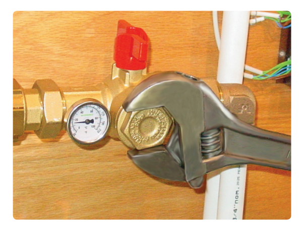
Step 7: Tighten the cap.