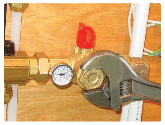
Step 2: Remove the filter-inspection cap.