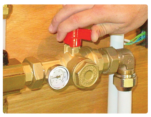
Step 1: Close the valve.

The Manifold Supply and Return Ball Valves (part number A2631250) feature an integrated temperature gauge and filter (strainer) inside the ball. This allows easy cleaning of the filter without having to drain the system. Gain access to the filter by simply closing the valve and opening the filter-inspection cap as shown in the following instructions.