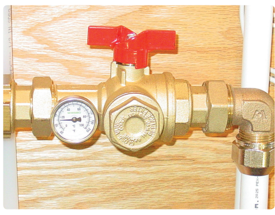
Step 8: Open the valve.

Uponor, Inc. 5925 148th Street West Apple Valley, MN 55124 USA Tel: 800.321.4739 Fax: 952.891.2008