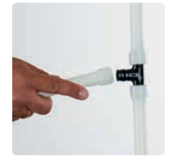
Push the expanded pipe end in quickly until it stops on the fitting nipple. Hold until the pipe is shrunk. Ready!

Expand the pipe end. To ensure a uniform expansion, the expander rotates according to the integrated auto rotate function.