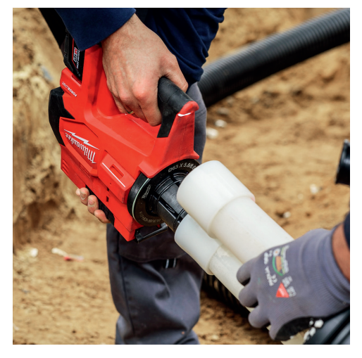
Expander tool Milwaukee M18 VLD PEX