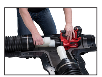
Expand the pipe end. To ensure a uniform expansion, the expander rotates according to the integrated auto rotate function.