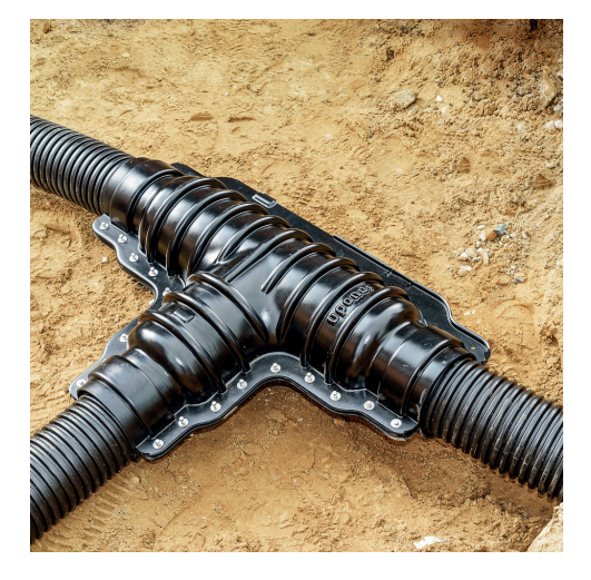
Uponor Ecoflex T-insulating set