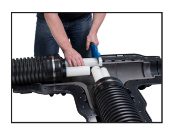
Cut the pipe edge vertically.