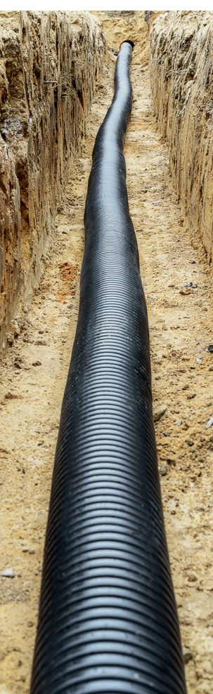
Ecoflex Thermo PRO