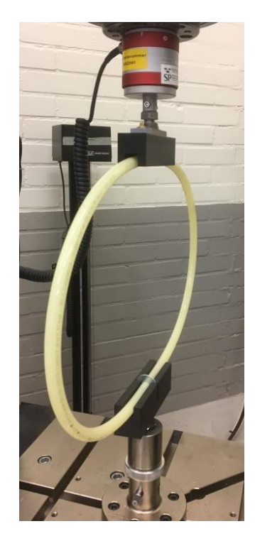
Figure 1 Generic picture of flexibility testing.