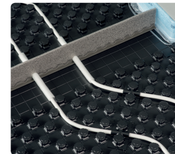
Movement joint profile for pipe routing in the door area

Because the compensation element does not have any studs in its flat part, the flexible heating pipe can determine its own path. Doorways are quickly dealt with and problematic negotiation of doorways is therefore a thing of the past.