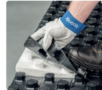
Overlapping elements provide safe and easy installation