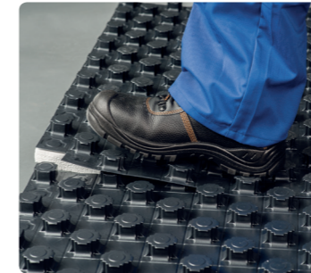
Accurate laying and joining without the need for additional help