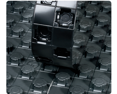
The double-sided strip gives even greater flexibility

Just use your foot to join up the elements where the laminate overlaps, and that's it! It saves on both time and costs.