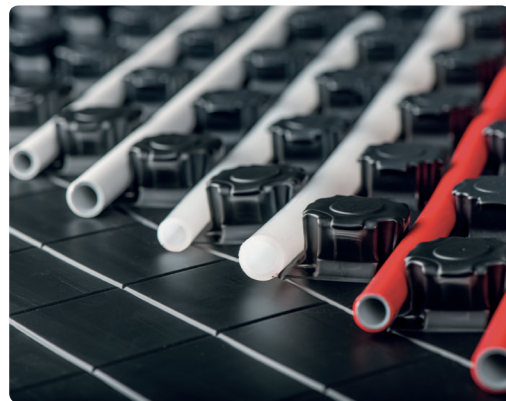
Perfect installation guaranteed

Uponor Tecto can also withstand extremely heavy loads: an astonishing 500 kg/m 2 in a nominal thickness of 38/35 mm and up to 3000 kg/m 2 in a nominal thickness of 11 mm.