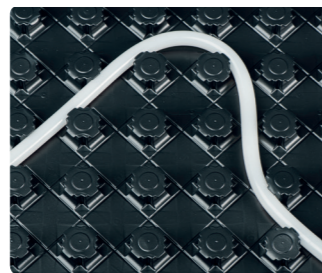
Tight bend radii possible