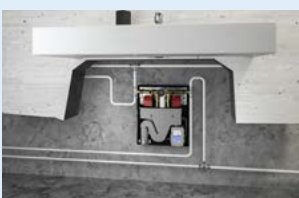
Wall mounted without washbasin frame