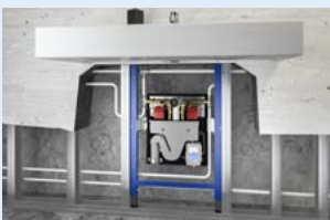
Integrated into drywall or sanitary walls