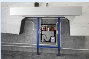
Pre-assembled in washbasin frame