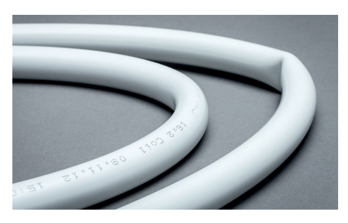
Comparing Uni Pipe PLUS