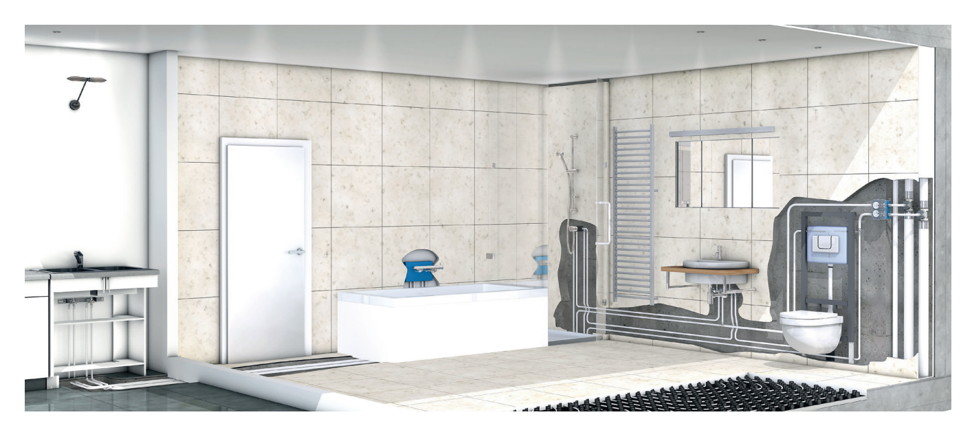
Closed circular pipeline (small radii) for kitchen and bath installations

You can choose just the right Uni Pipe PLUS composite pipe variant for your precise needs on site – as bar or roll goods, pre-insulated or pipe-in-pipe. Should you like more information about all your benefits and options, we are happy to provide personal assistance.