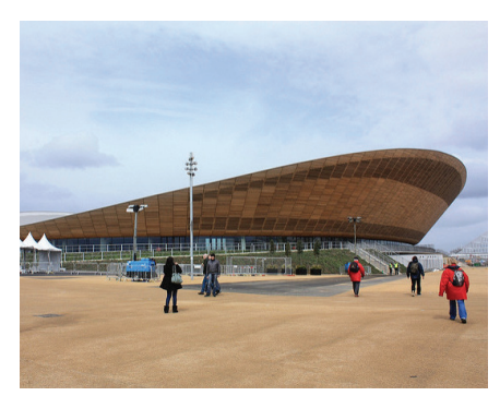
Olympic Velodrome 6,500m of MLC