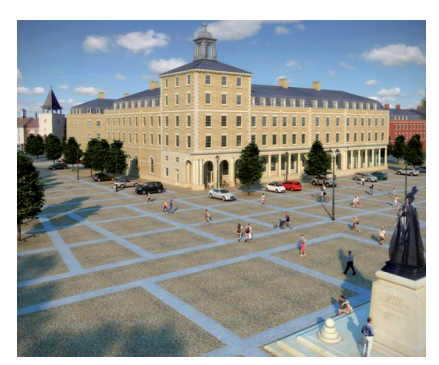
Kingspoint House, Dorchester 9,300m of MLC