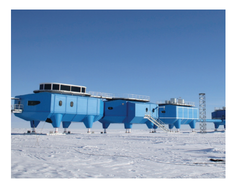
British Antartic Survey 2,300m of MLC