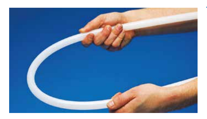
Expand the pipe Insert the fitting