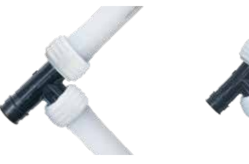
Start of the test