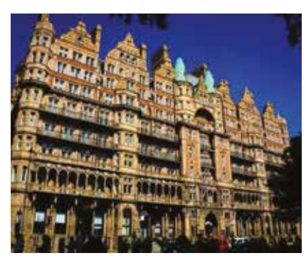
Hotel Russell, London 16,000m of Q&E Shrink-Fit