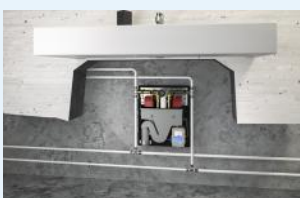
Wall mounted without washbasin frame