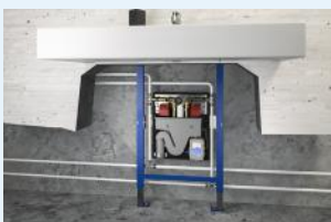
Pre-assembled in washbasin frame