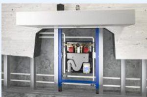
Integrated into drywall or sanitary walls