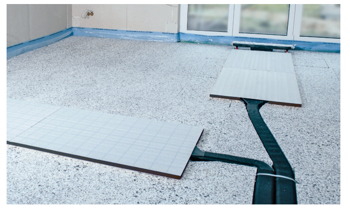
Uponor Comfort Air is installed together with the Pluggit Pluggflex ventilation ducts. The corresponding adapters enable professional integration into the ventilation system.