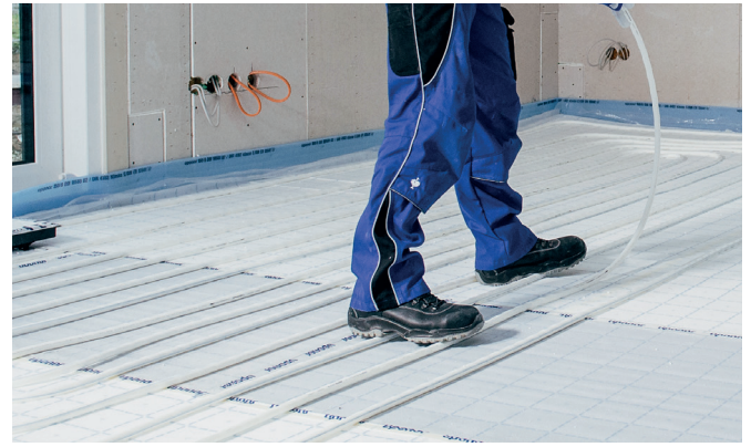
The intermediate spaces are filled with Uponor KLETT panels and the underfloor heating pipe is laid quickly and easily over the entire area of the room.