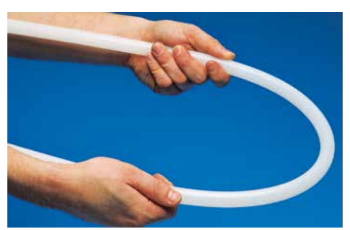
Bend radius for 1/2" tubing: CPVC = 18"; PEX = 31/2"