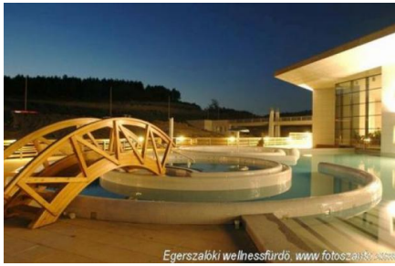
Egerszalóki wellnessfürdő, www.fotoszaki.hu