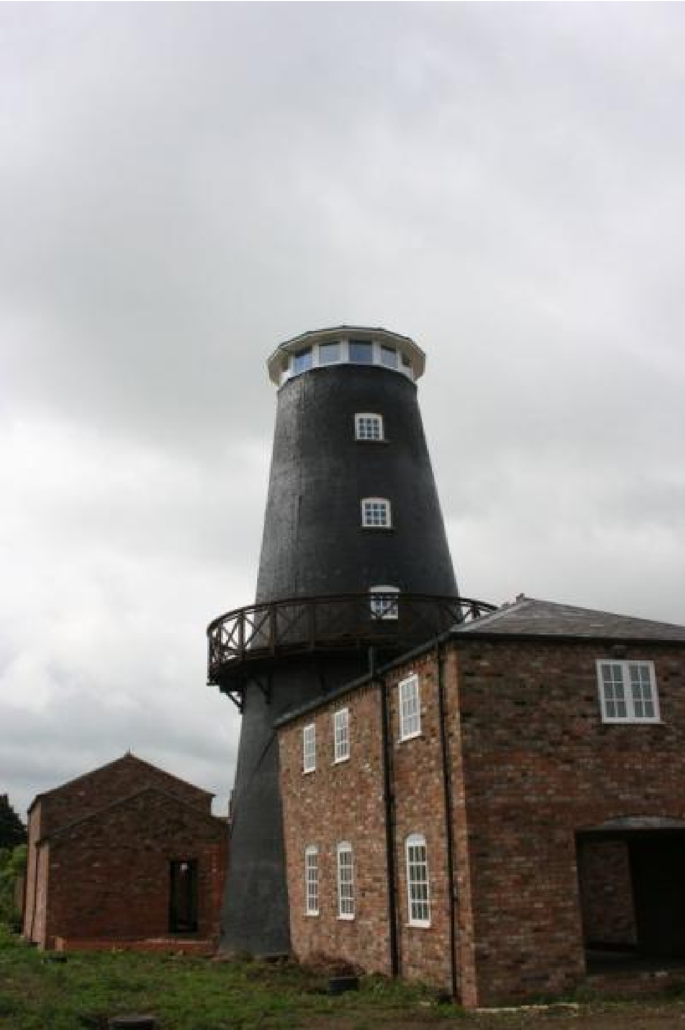
Blackmill Doors Windmill