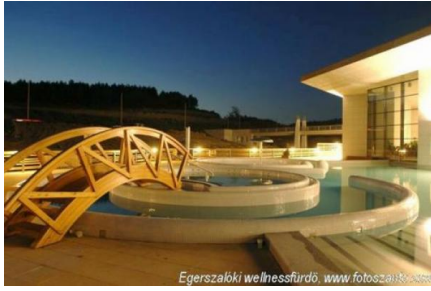
Egerszalóki wellnessfürdő, www.fotoszaki.hu