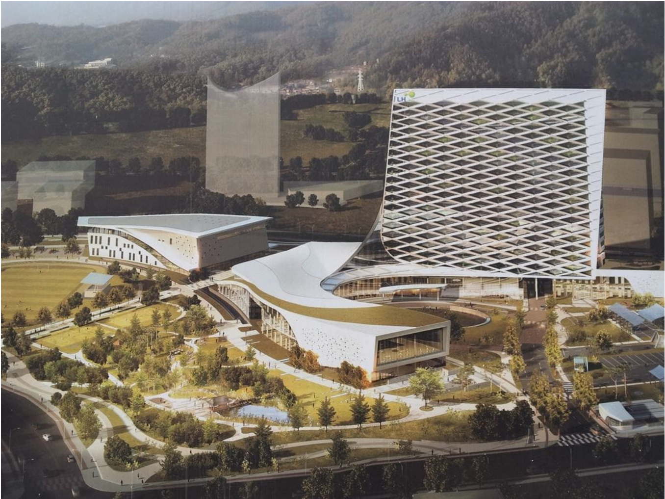
LH Headquarter in Jinju