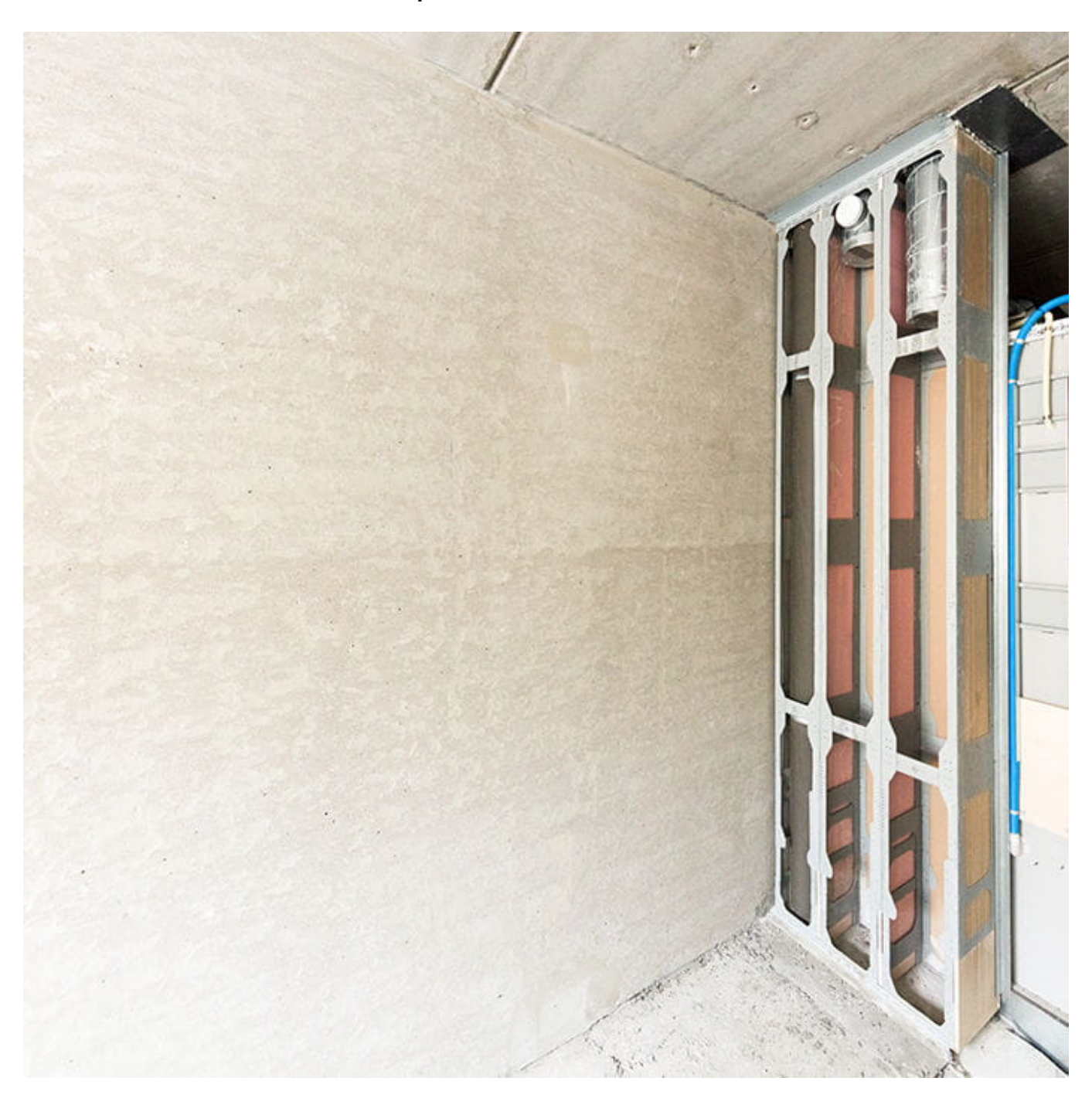
Aleksanterinkatu 5 in Lahti will be completed with R2I blocks