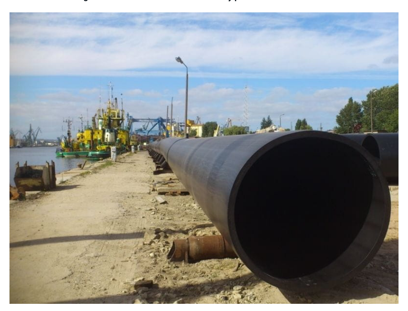
Sea outlet - discharge of stream water into the Gdańsk Bay part 2

manufactured in considerably longer lengths than traditional pipes, which significantly shortens the installation time. What's more, polyethylene pipes have superior chemical resistance and don't corrode, which is a key factor when it comes to applications in salt water. Therefore, PE-HD pipes are the perfect solution for marine projects.