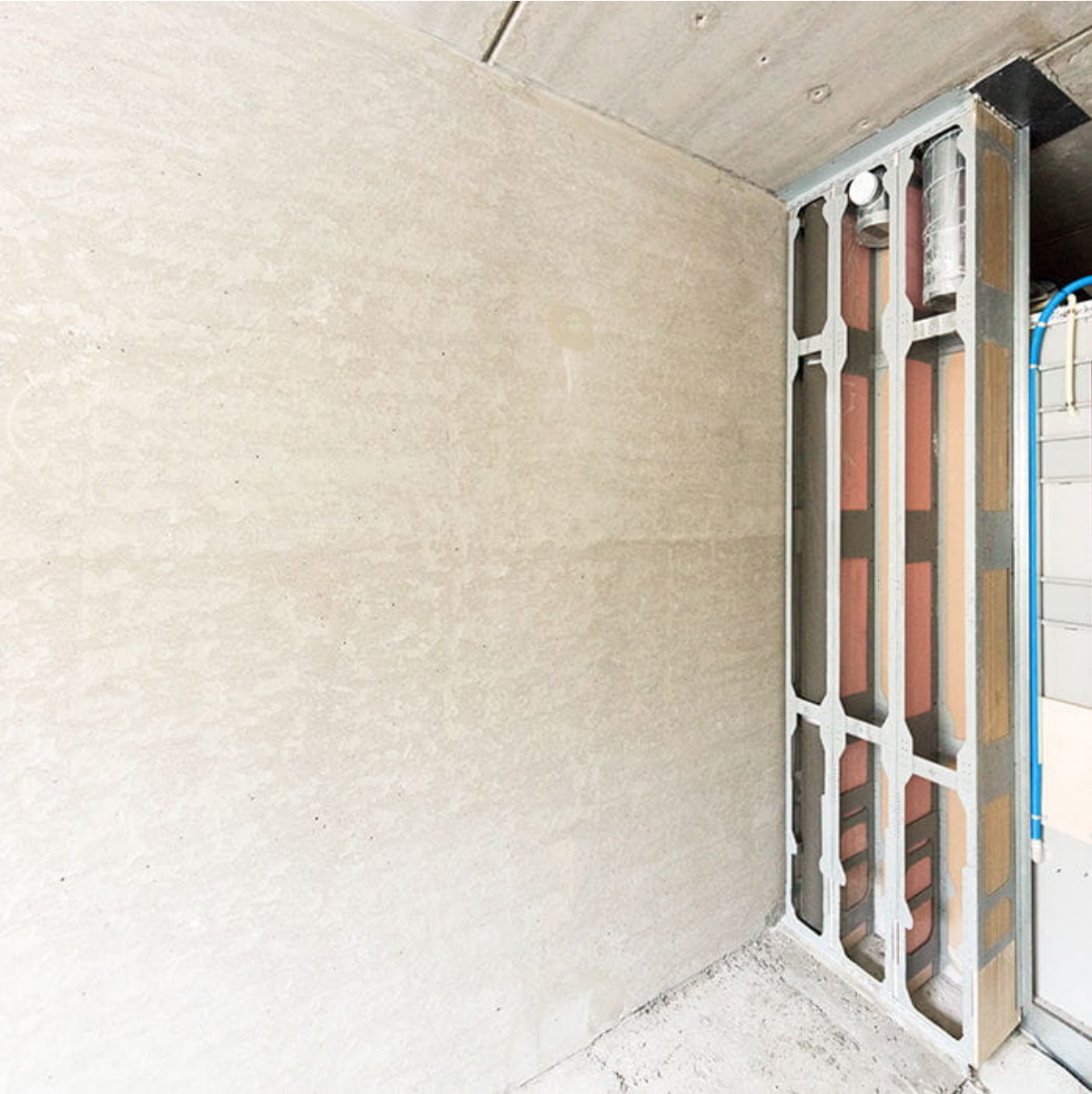
Aleksanterinkatu 5 in Lahti will be completed with R2I blocks