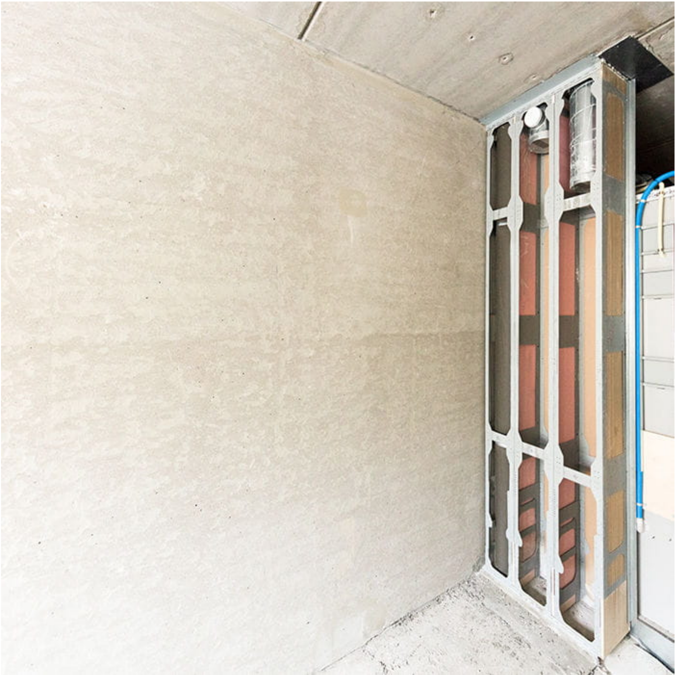
Aleksanterinkatu 5 in Lahti will be completed with R2I blocks